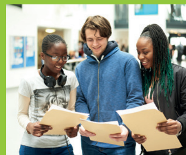
Page 3 Results Roundup