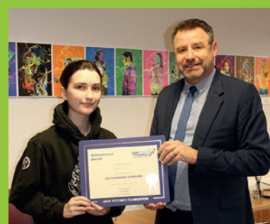
Page 5 Jack Petchey Success