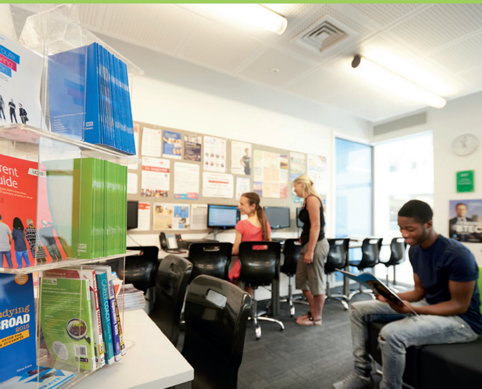
The College's Careers Department